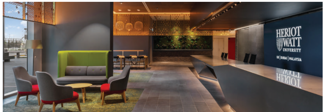
Heriot Watt University