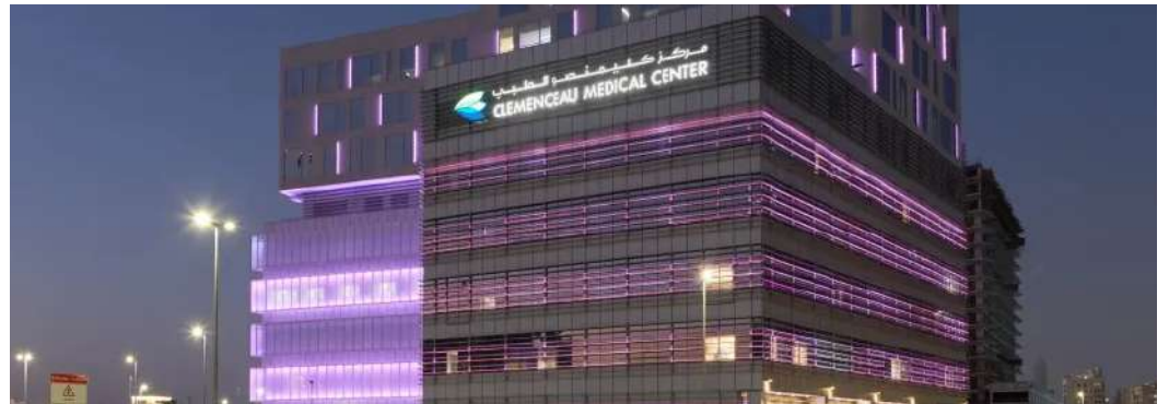
Clemenceau Medical center